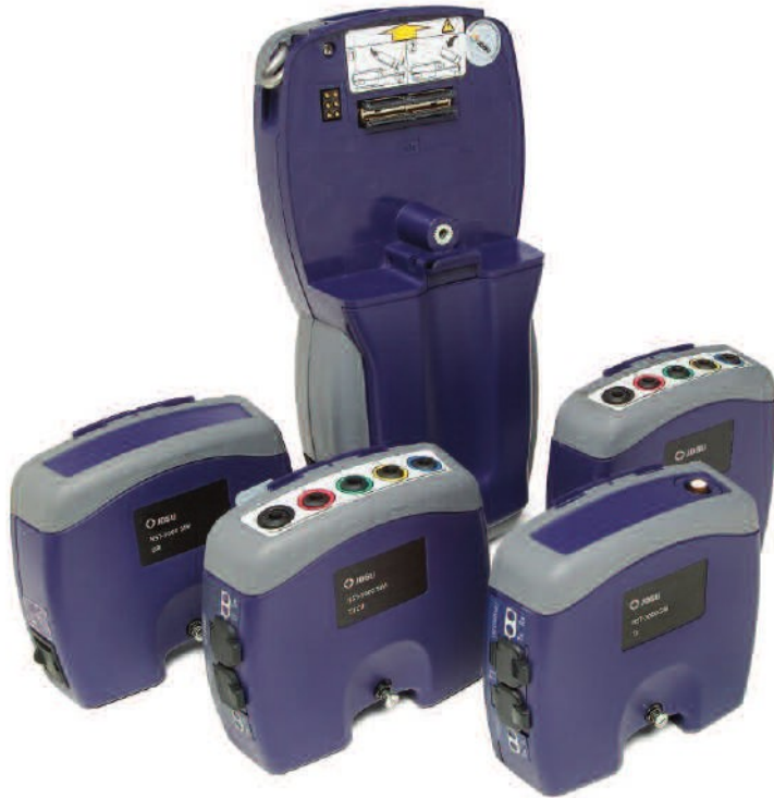
Figure 2. The architecture of the HST-3000 enables fast, easy field-swapping of a wide variety of test modules.

To accommodate the future and changing needs of wireless field technicians, the HST-3000 is an easily upgradeable platform that will allow for the support of new technologies and advanced options.